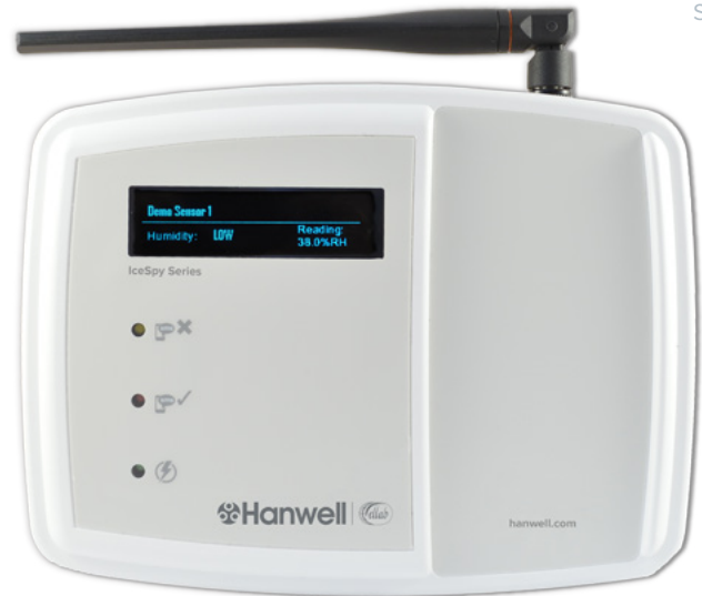
Product code: IN-TA003