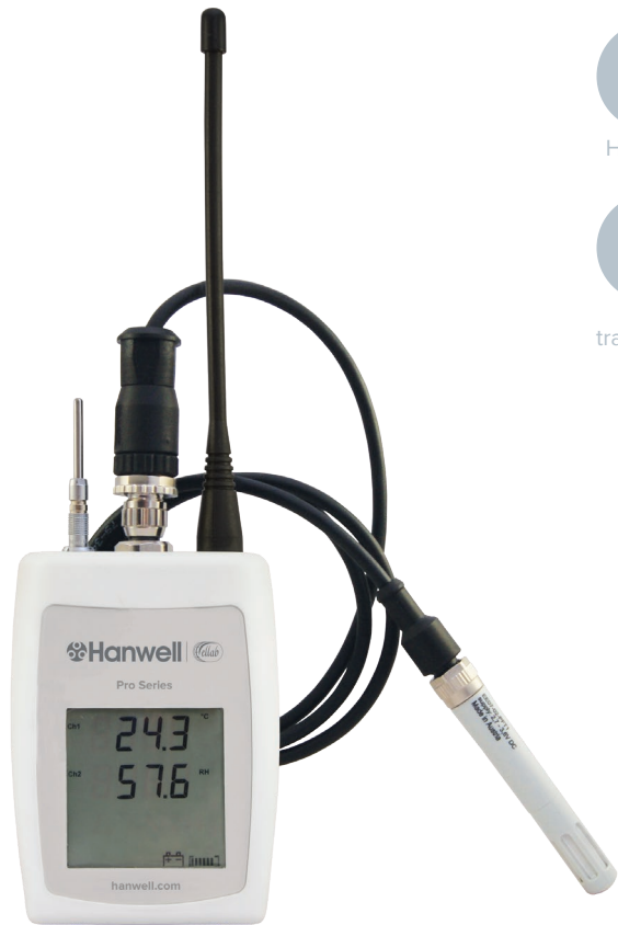
Product code: RL4116-434.075