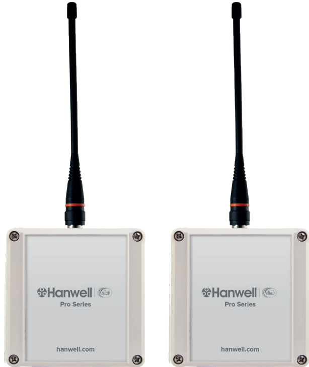
Product code: REP04PU-434.075 (other frequencies are available)