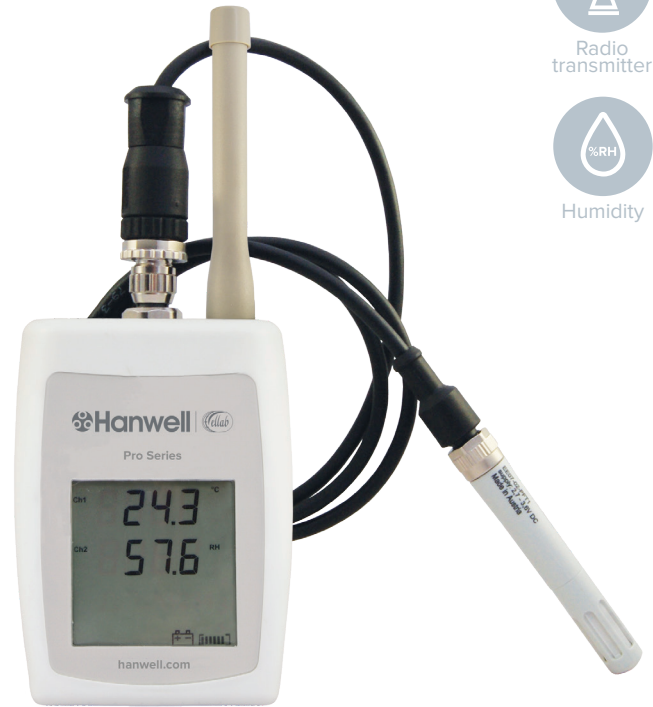
Product code: ML4114-434.075