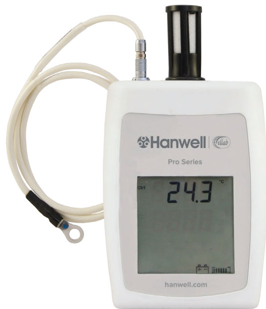
Product code: HL4108