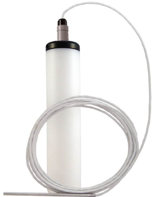
Product code: RL1006-434.075 (other frequencies are available)